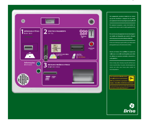
Actual E-Toll user interface layout

Regarding this, the E-Toll user interface undergoes several interactions during the development process, improving its usability.