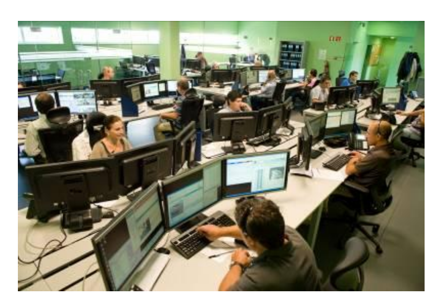
Remote Support Center

One of the innovative aspects of this machine is the remote assistance made by human remote operators, observing and follow remotely all the operation (classifying the ambiguous vehicles and helping the users operate the machine), using video cameras and communication via Voice over IP (VoIP).