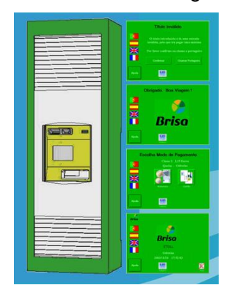
E-Toll early prototype

since although it provided the basic functionalities to be successful, it still didn't had the best answer to face exceptional scenarios, like when a customer had no ticket, or if a jam occurred – an operator always had to access the toll lane, thus forcing Brisa to have someone on the neighborhood.